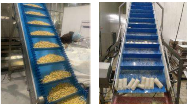
Containment of product (cashews)