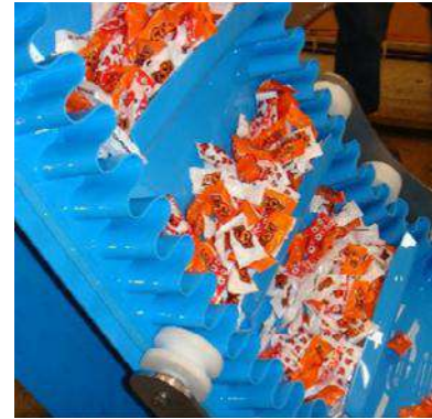
and even for packaging conveyors

Conveyors can be designed to conform to principles of Hygienic Design;