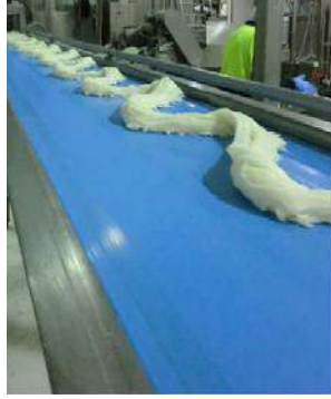
Raw product mass