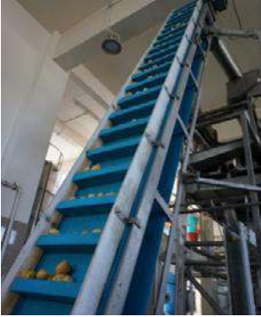
Raw material intake