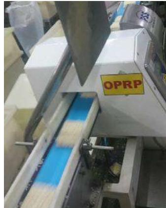
In metal detectors