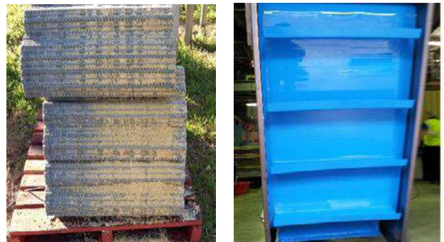
Compare a modular belt with the replacement Volta Positive Drive belt