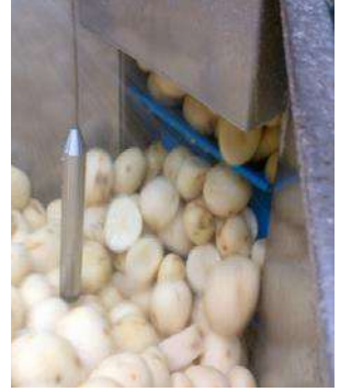
Unaffected by hydrolysis