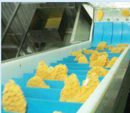
HF Welded Flights