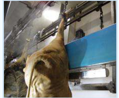
Heavy Weight Movement